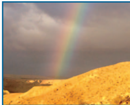
One of several rainbows over Midreshet Ben Gurion Friday morning January 27th