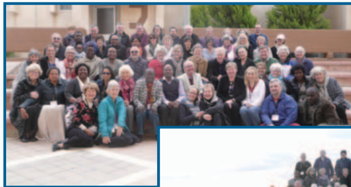
International ASKers gather in the Negev

is a bi-monthly communication on behalf of ASK Network International. It is an invitation to join the network of prayer throughout the nations, ASKing and agreeing regarding key issues on God’s heart. It is a tool for prayer, a place for testimony to God’s faithfulness in answering, and a gift of worship to the Living God.