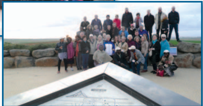
Black Arrow, at Gaza Strip Border