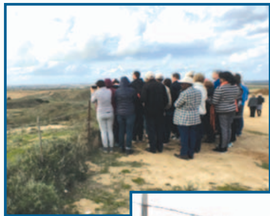
Sderot, Gaza Strip Border

In your majesty ride forth victoriously in the cause of truth, humility and justice; let Your right hand achieve awesome deeds. Psalm 45:4