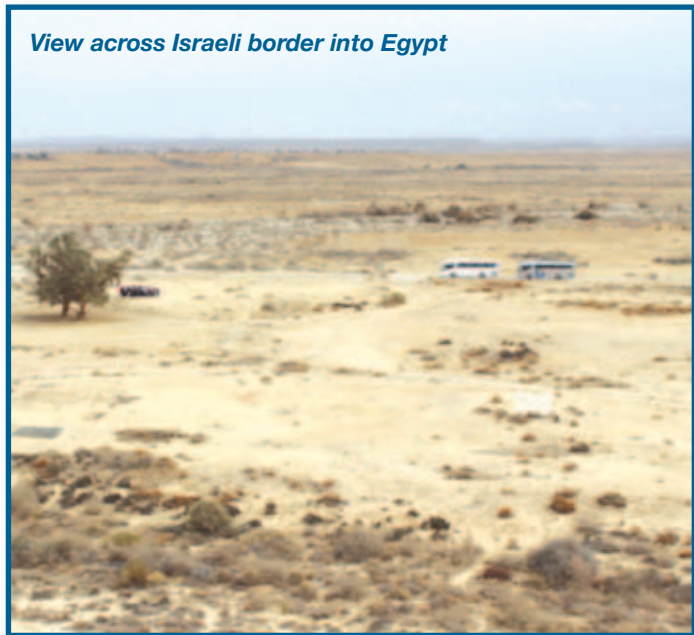
View across Israeli border into Egypt

Unless the LORD watches over the city, the guards stand watch in vain. Psalms 127:1