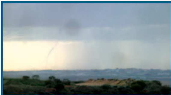
Water Spout over the Mediterranean spotted as we finished praying.