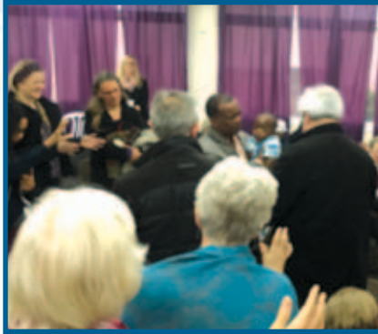
Nations praying for nations

By the grace of God we fulfilled our call to pray for all nations. We had time to pray for all the continents. In those times different ones took responsibility to adopt individual nations from each continent for prayer. Thus, being able to bring each nation into the presence of the Lord by name. What a joy it is to be reminded that each and every nation is precious to Him.