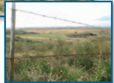
Signs seen after we had finished ASKing for Israel's borders and neighbours.